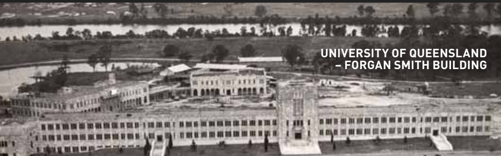
UNIVERSITY OF QUEENSLAND - FORGAN SMITH BUILDING