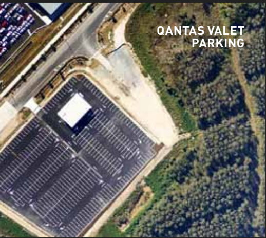
QANTAS VALET PARKING