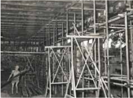
THE J.S. BOX & CO TEAM HARD AT WORK IN 1962 ON THE ST HELENS HOSPITAL AT SOUTH BRISBANE (LOCATED NEAR TO WHERE THE STATE LIBRARY IS TODAY).