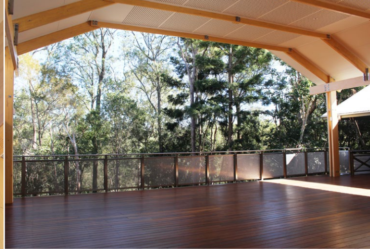
THE NEW ENTERTAINING DECK AT WALKABOUT CREEK DISCOVERY CENTRE, ENOGGERA RESERVOIR