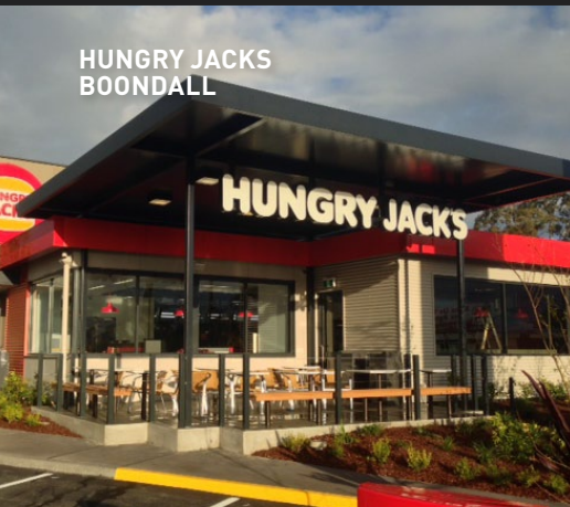
HUNGRY JACKS BOONDALL