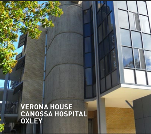
VERONA HOUSE CANOSSA HOSPITAL OXLEY