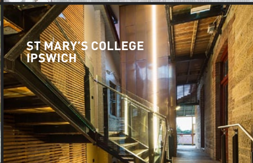
ST MARY'S COLLEGE IPSWICH