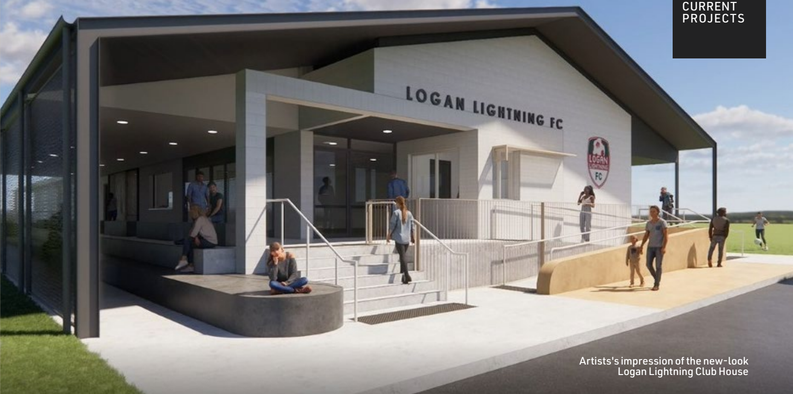
Artists' impression of the new-look Logan Lightning Club House